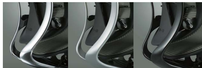
Frame Color: Polished