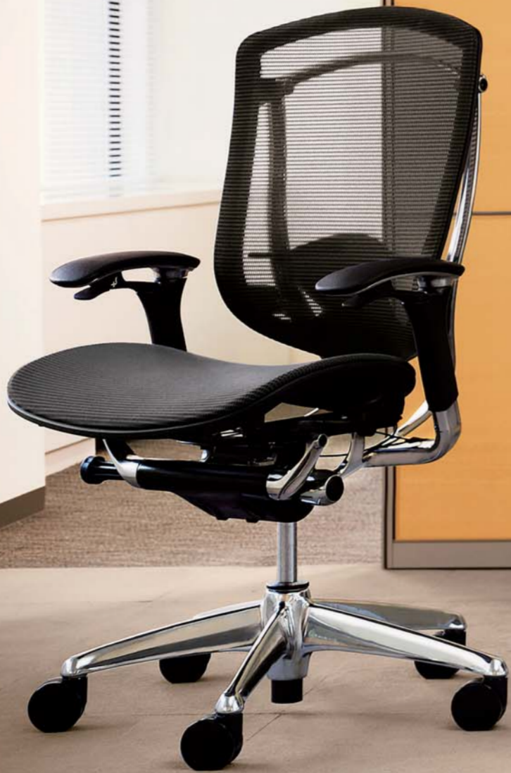
FBH2 Dark Gray