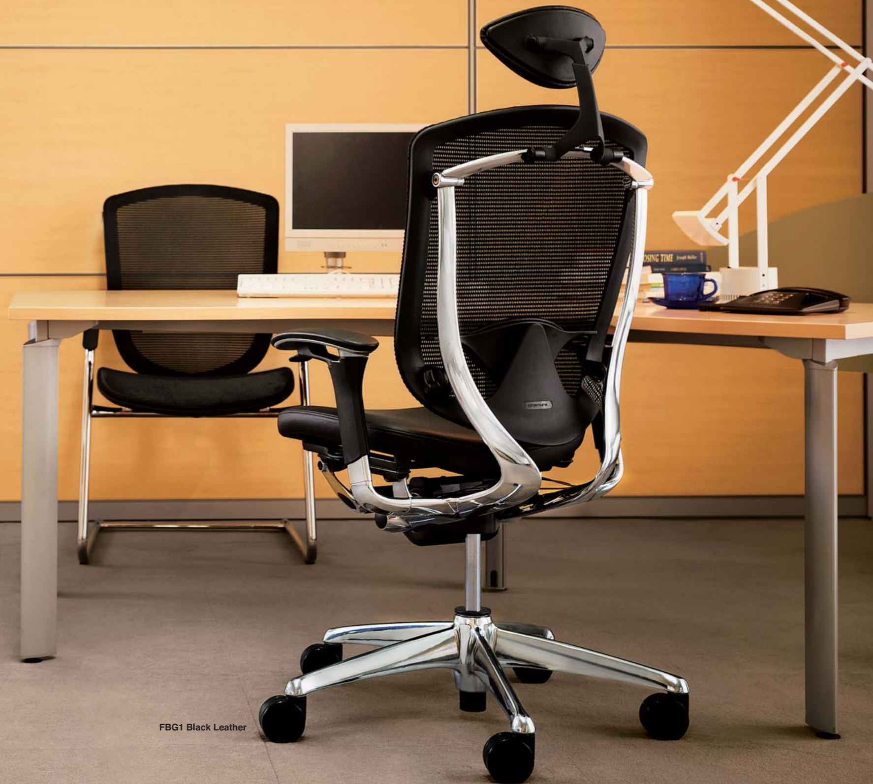
FBG1 Black Leather