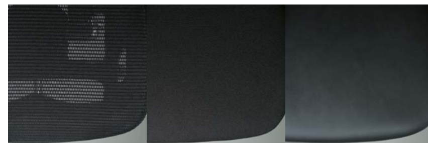
Seat Type: Mesh