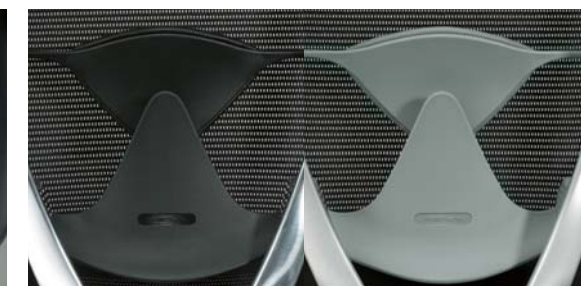
Body Color: Black