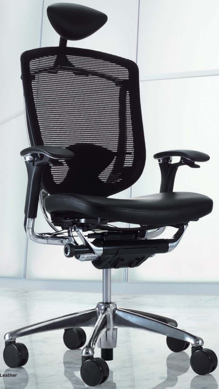
FBG1 Black Leather